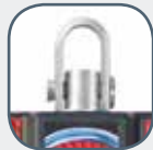
Without Unit Connector